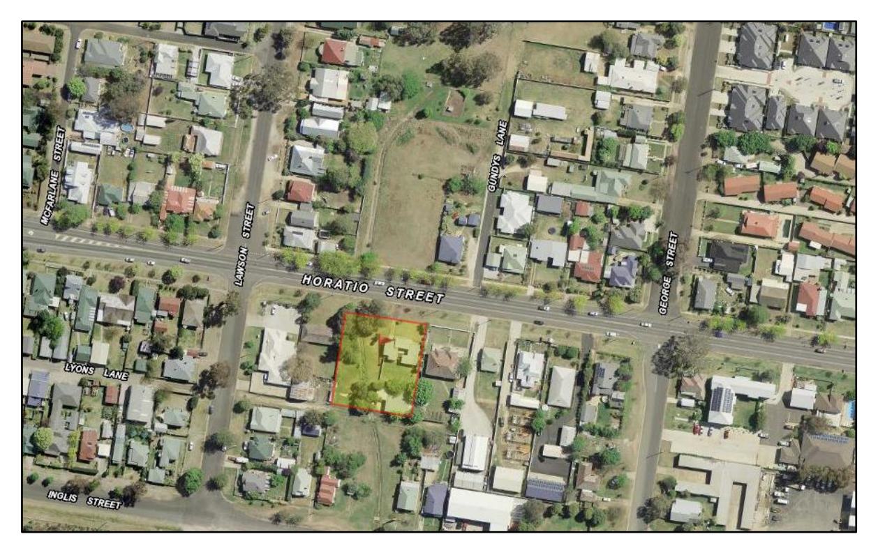
Figure 2: Aerial – vicinity of subject land