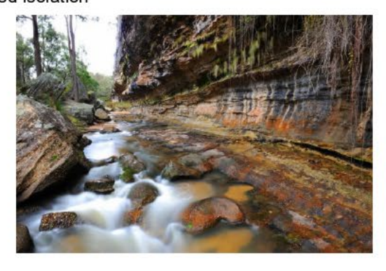
"The Drip" https://mdeg.org.au/wp-content/uploads/2017/05/10_the_drip_mudgee-959x640.jpg