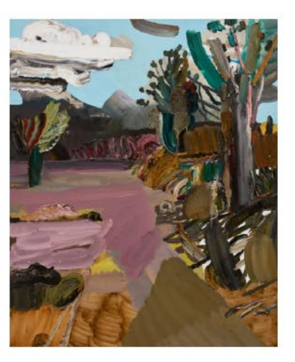
LL11 2020 oil on linen 168.0 x 138.0 cm