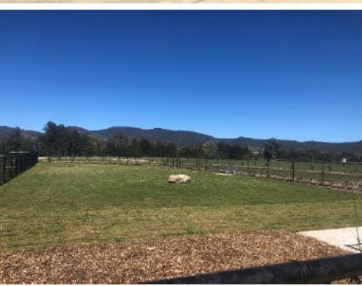
PAGE 6 OF 9 | MID-WESTERN REGIONAL COUNCIL