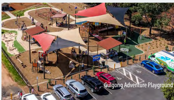
Gulgong Adventure Playground